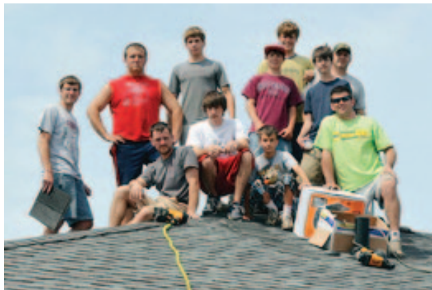
Indee Wrestlers work on roofing the facility.