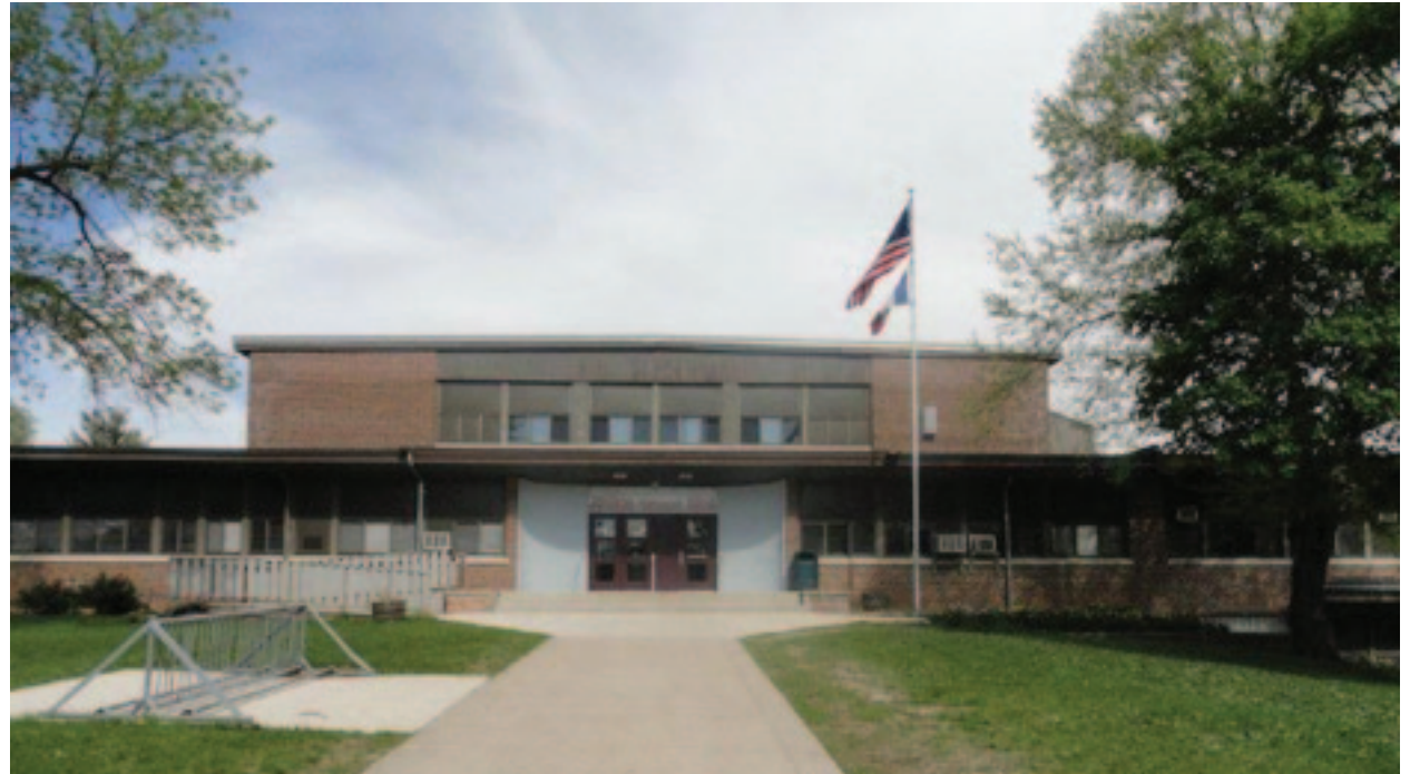
Current Independence Community School District Junior/Senior High School.

If you have suggestions, things the Committee might plug into a tour date do not hesitate to let the Committee know your thoughts at alumni@indeealumni.org , or call 319-361-3216. ◆