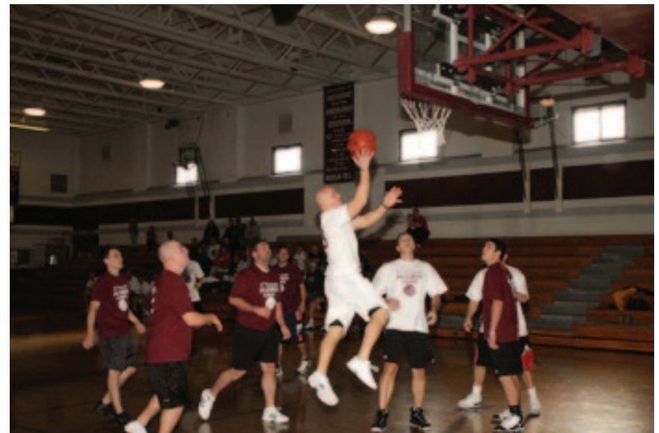
First Annual Men's Alumni Basketball Game (2011).

Attend the Boy's Game the Night before vs. Benton Community. Varsity Tips @ 7:30.